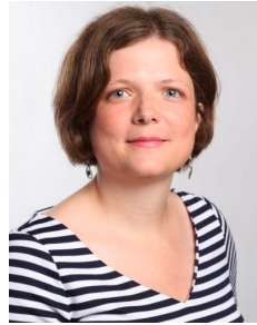
Petra Arts Board Member