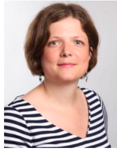
Petra Arts Board Member